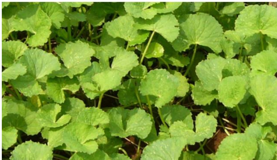
Figure 3. Centella asiatica 14

Centella asiatica or Gotu Kola grows in tropical and subtropical areas. 8,11 It measures up to 15 cm, with 1-3 leaves measuring 2- 6 cm long and 1.5-5 cm wide on each stem. The flowers are white to purple or pink. 12 Taxonomically, Centella belongs to the family Apicaceae ( Umbralliferae ) and has 20 species. 13